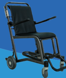
Guest Service 600lb