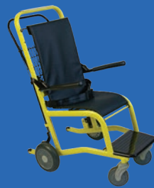
Cub Pediatric 300lb